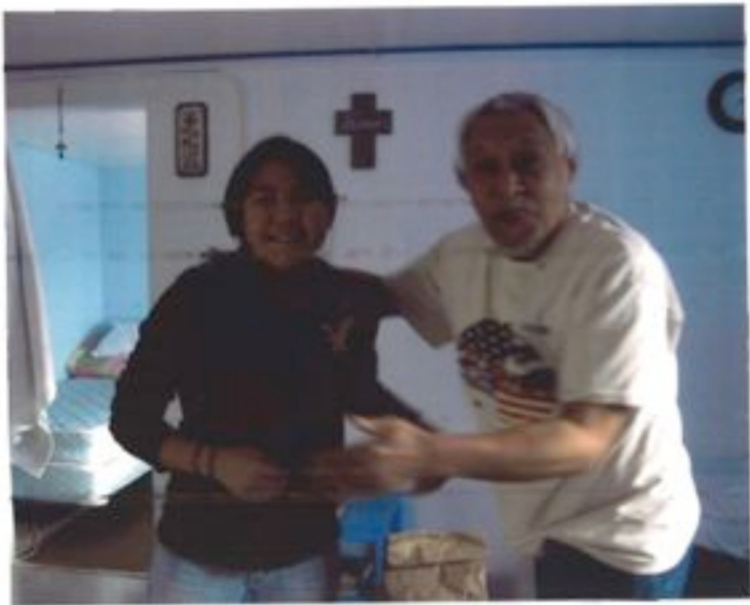
Delivering bags of Eskimo donuts to the elders