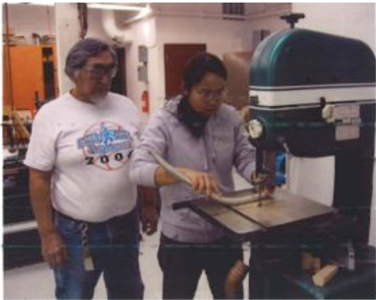
Cutting a caribou antler for the ulu's handle