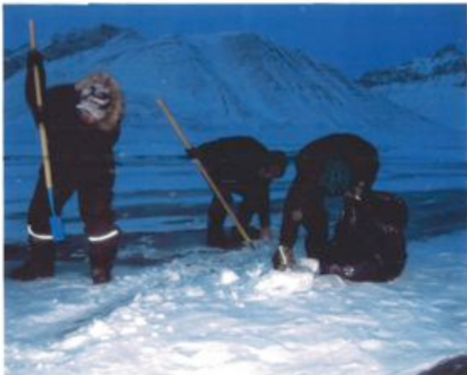
Chopping lake ice for the elders