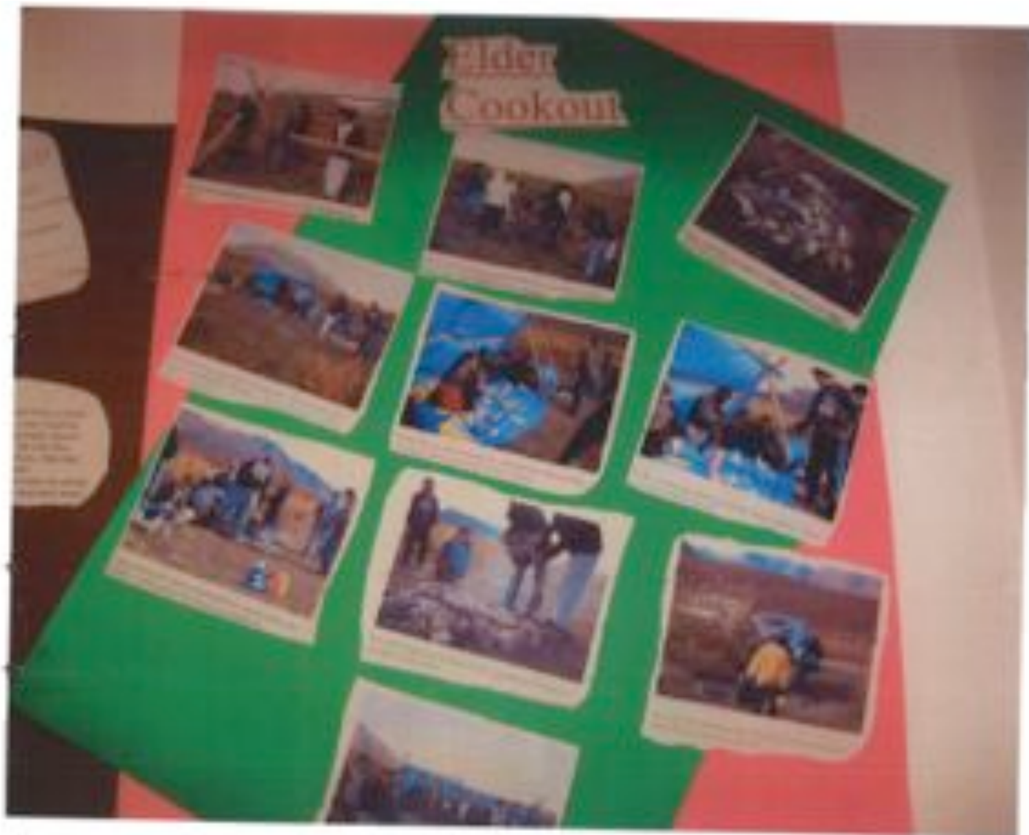
Sample of one of the posters we made following our cookout