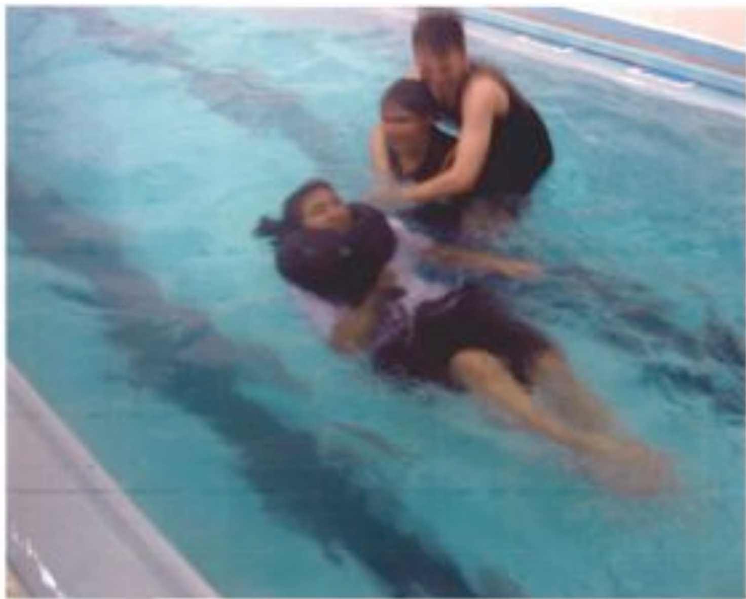
Cold water survival activities