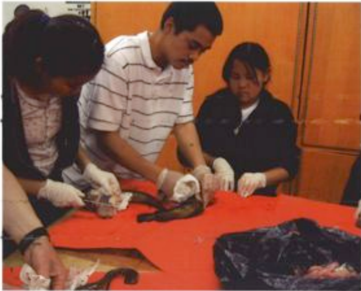
Preparing our fish for the elders' cookout