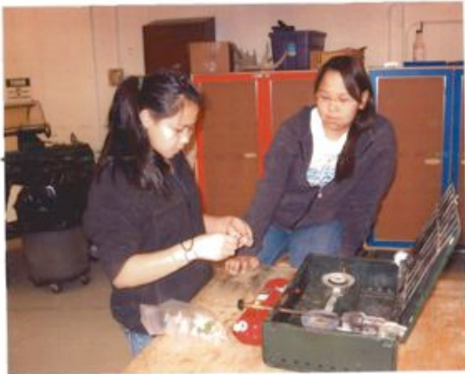
Learning to use a sigruk (Coleman camp stove)