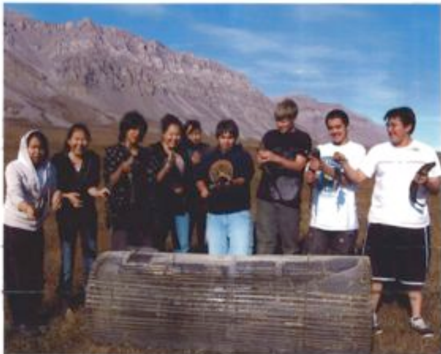
Catching tiktaaliq in our traditional fish trap