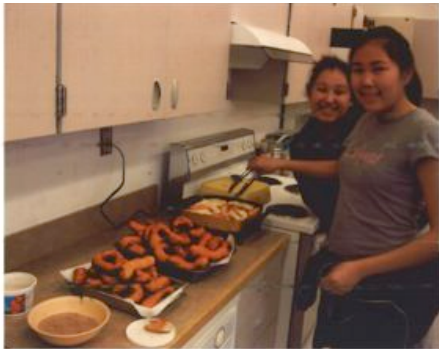
Making Eskimo donuts