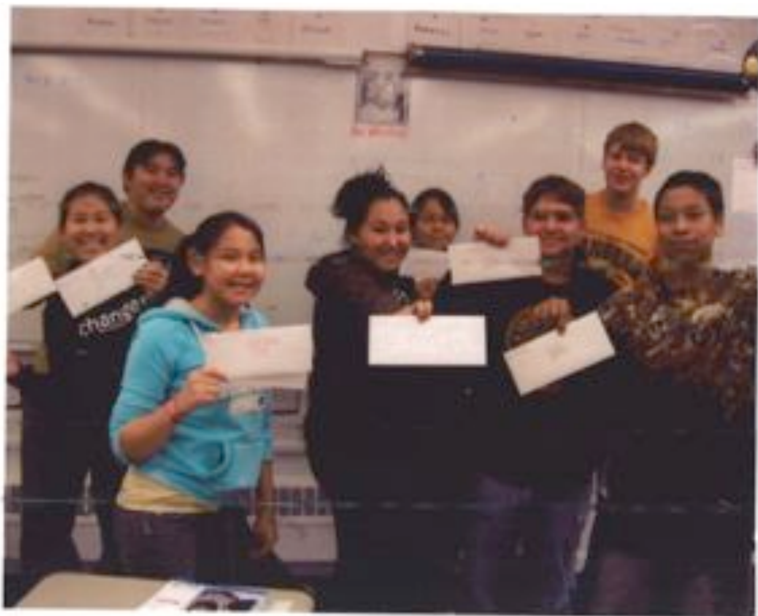
Mailing get well letters to sick elders