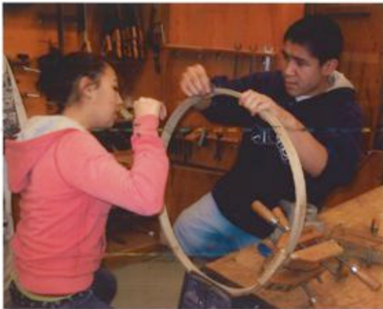
Sanding the drum frame