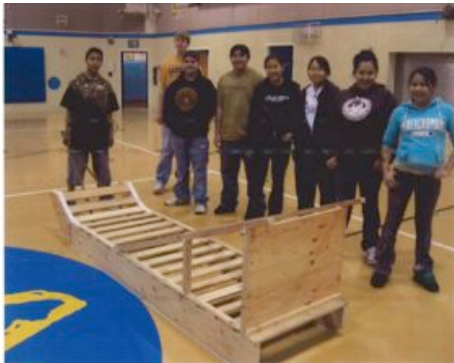
Our first sled