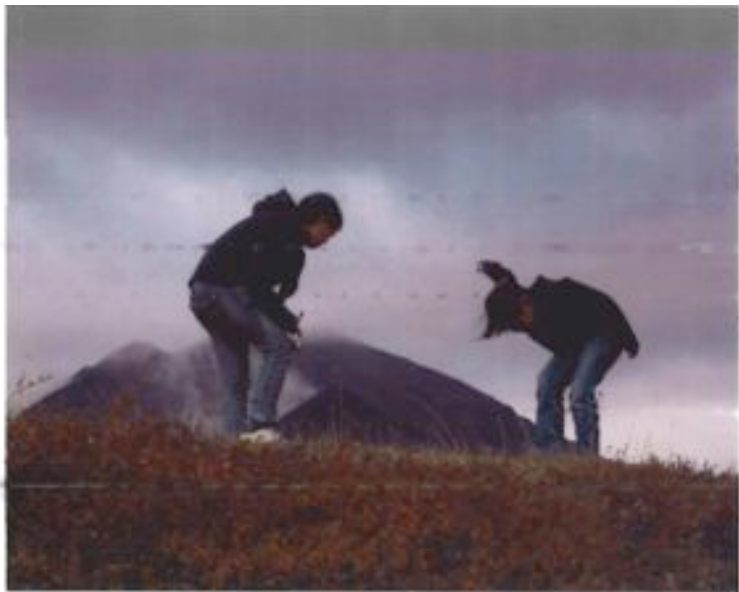
Tundra scavenger hunt with the elementary students