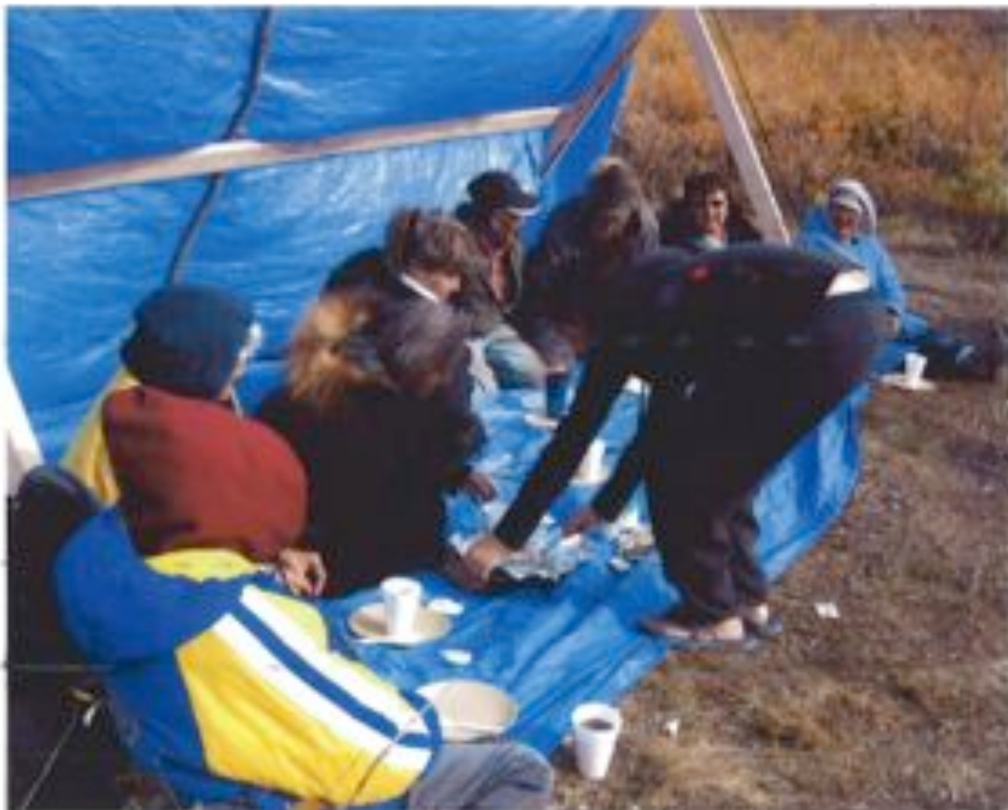
Serving the elders at our cookout