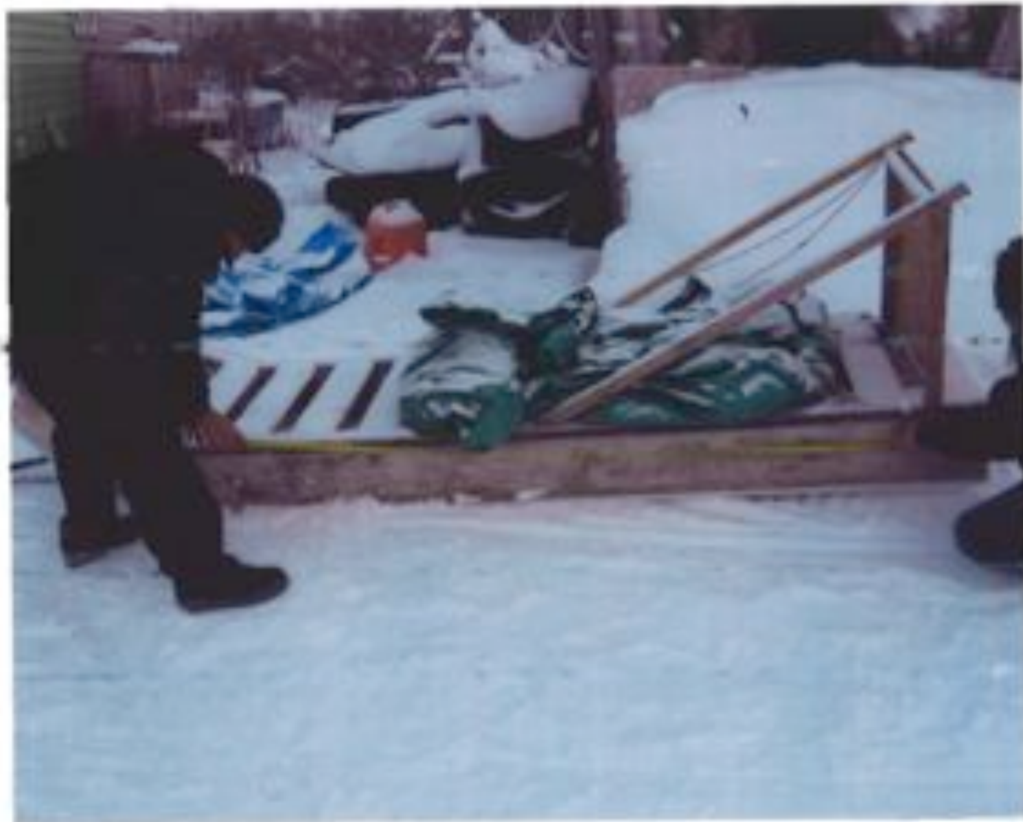
Taking measurements around the village before building our wooden freight sleds