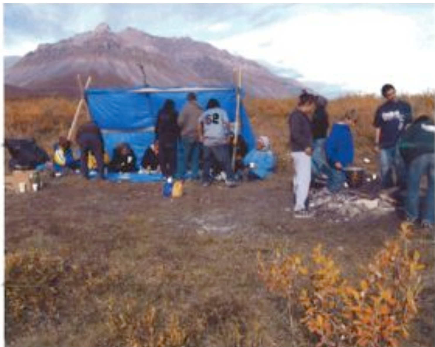
Hosting a fish cookout for the elders